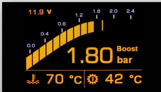
Boost pressure display